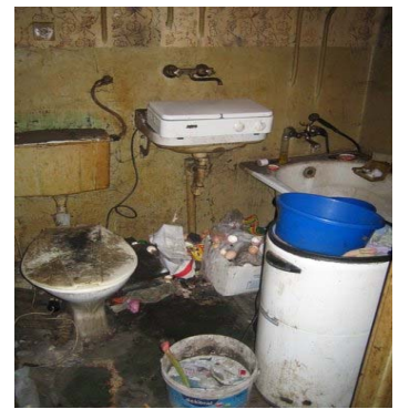
A usable toilet