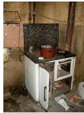
A place to cook.