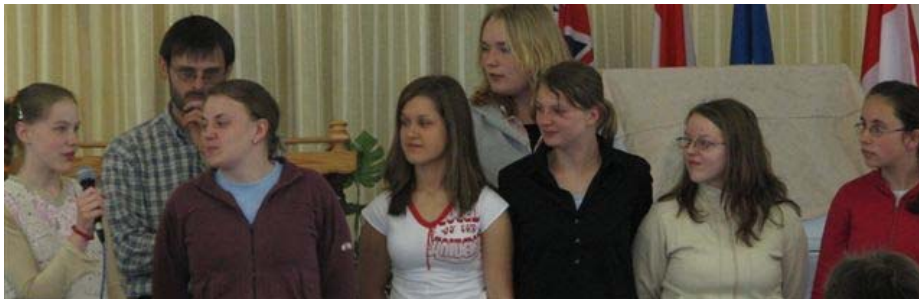
Several of the teenagers saying thank you for their sponsorship to camp.

God has led 9 youth from our church to attend the Discipleship Camps this year. These camps are different than all other camps, as the sole purpose is to train and disciple the youth in deepening their relationship with Jesus Christ and to prepare them for the Lord's service in their community through their local church. The camp for the younger youth is 4 weeks long, and the older youth camp runs 6 weeks. Wonderfully, all of the 9 teenagers received sponsorship, without which many would not have been able to attend because of the families' financial situations. We look forward to great fruit in their loves resulting from these camps.