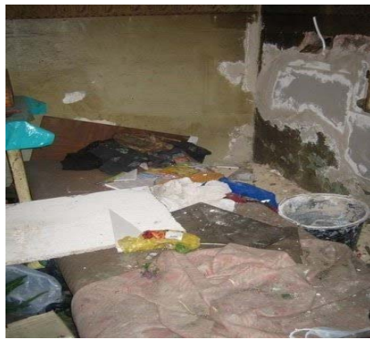
A place to sleep.