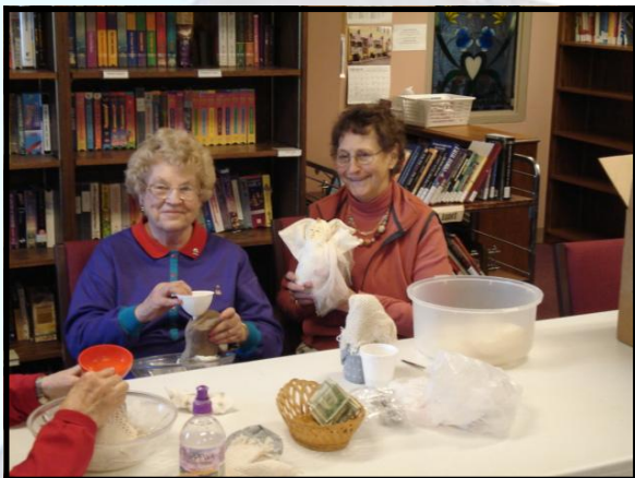
A women's group from S. Carolina U.S.A. finishes off Nativity pieces

The Lord continues to bless the Nativity Set Ministry through people who visit the mission as well as coordinators both here in Europe as well as Australia and the U.S.A. It was started in 2004 and sponsors more than 20 needy families. Many lives/families have been changed through this ministry and families who in the past have been among our needy families are now able to take care of themselves. We thank the Lord for His provision and for those of you who have gone the extra mile in sharing these Nativity Sets with others. If you are not familiar with this ministry please go to our website: www.elimcenter.pl and click on 'mission' and then 'mission ministries'. For those of you who may be wondering how you may obtain a Nativity Set, or become involved in helping with this Project, please write to us (we are praying for people to come on board to help out with this).