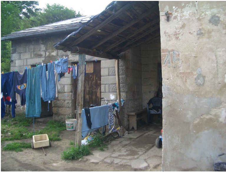
The side of House and entrance. This has since been built in to make a warm entrance room to the home. Many of the other parts of the house have had other further renovations since taking the above pictures.