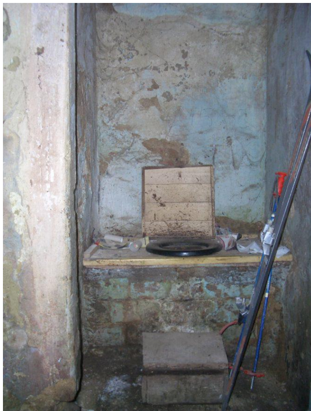
The toilet. (No running water, no bathroom)