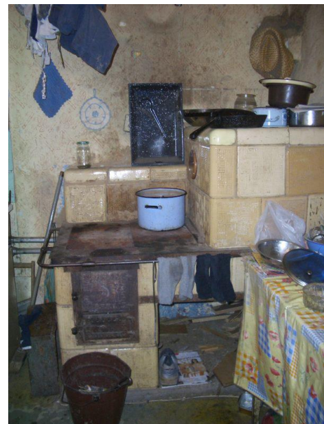
Her humble Kitchen, which has been renovated since helping on the Nativity project.