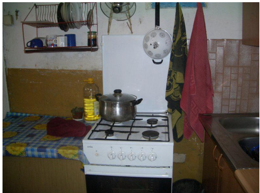
God's provisioning - Praise the Lord!