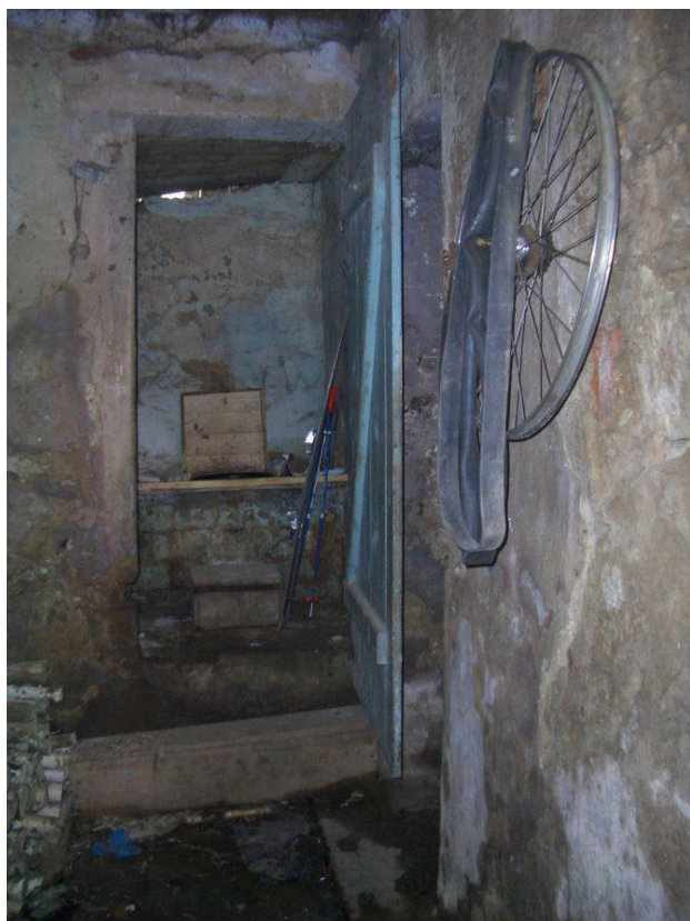
A Corridor in the shed, leading to the toilet.

Through being on the sewing project for the Nativity Sets, she has been able to obtain running water in her home, put in a running toilet, bath, sink and washing machine.