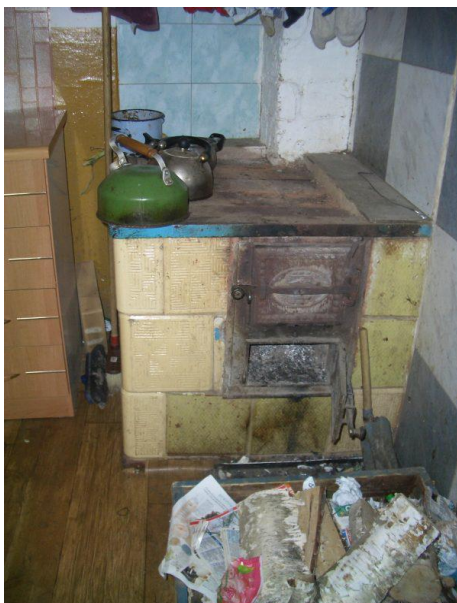
Their old wood stove.